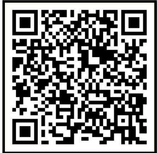
Photo Collage of the Department

Paryavarnam – Environmental E-Newsletter