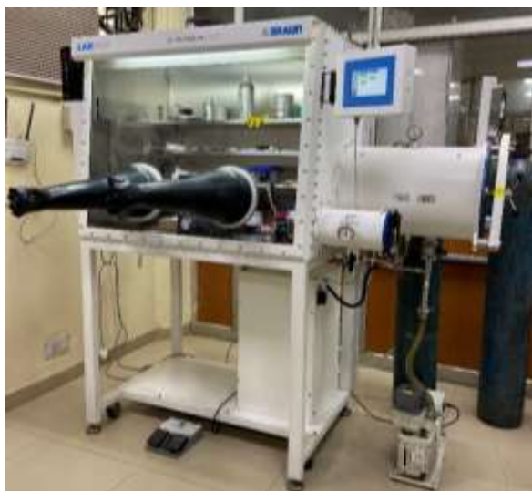
Glove Box Workstation