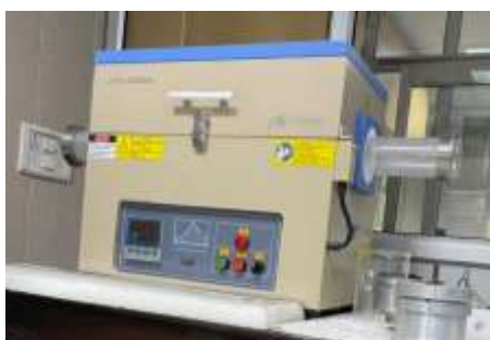
Horizontal & Vertical Furnace