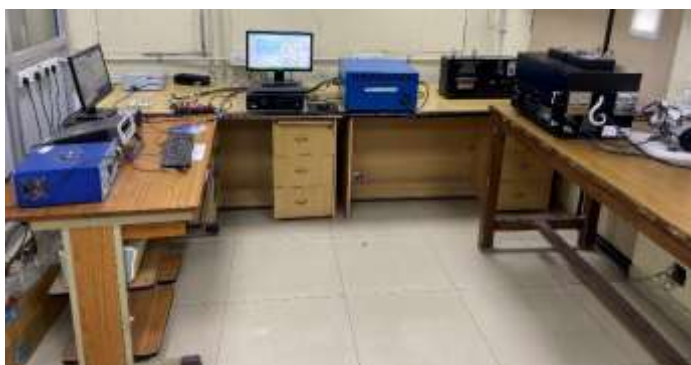
Li/Na-Ion Battery Testing Facilities