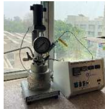
High Pressure Reactor