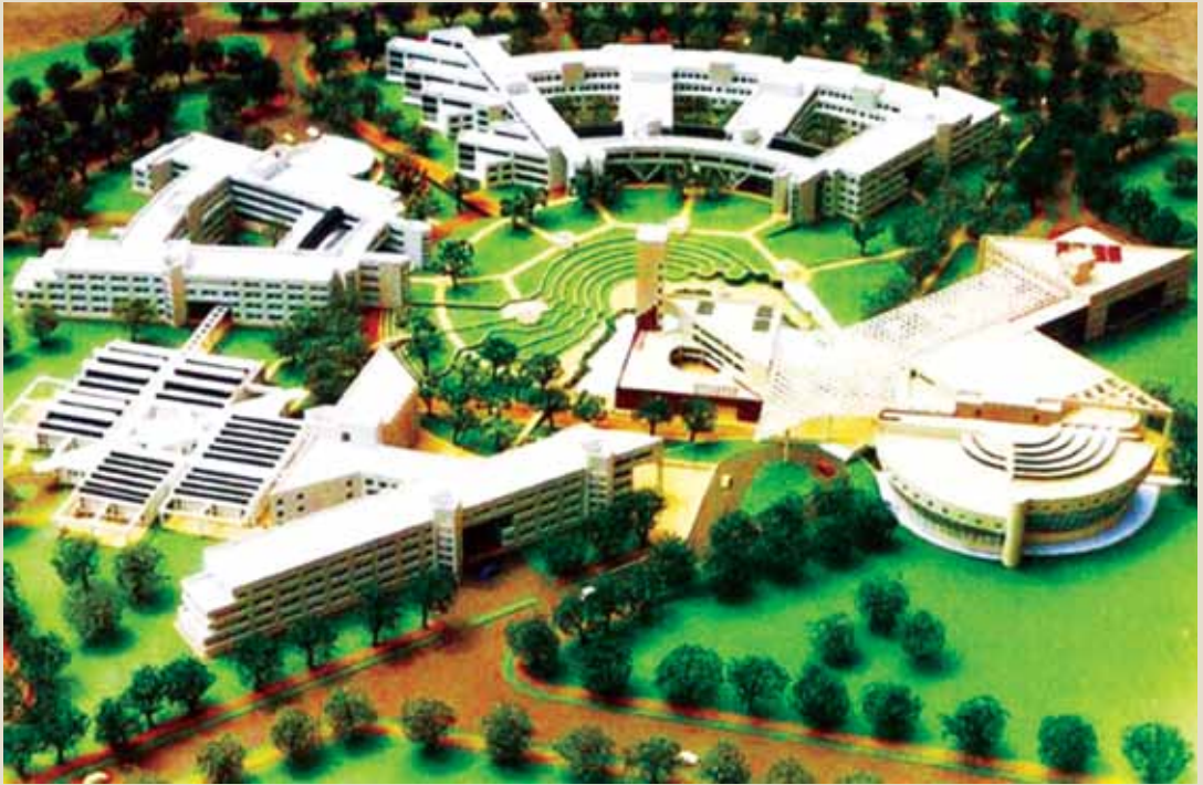
AERIAL VIEW OF INSTITUTIONAL COMPLEX, DTU, SHAHBAD DAULATPUR, MAIN BAWANA ROAD, DELHI-110042