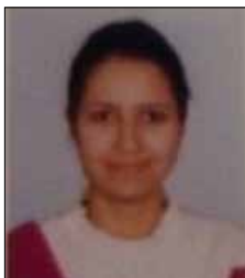
INDU 2K10/SPD/03 M. Tech. (Signal processing & Digital Design) 2011-12