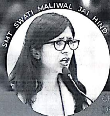
SMT SWATI MALIWAL JAI HIND