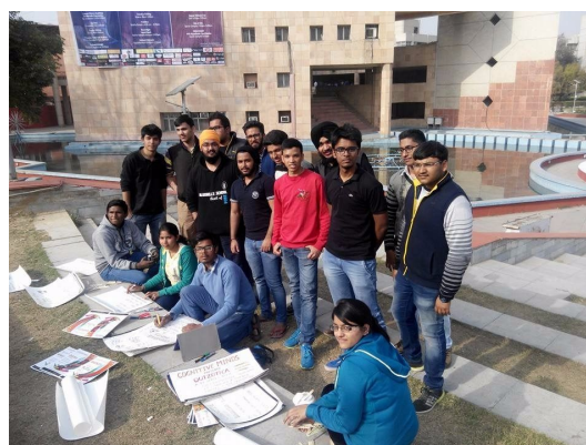
Society members working for yuvaan.

Our members managed, conducted and coordinated, to their own development, the events of YUVAAN 2017 very efficiently.