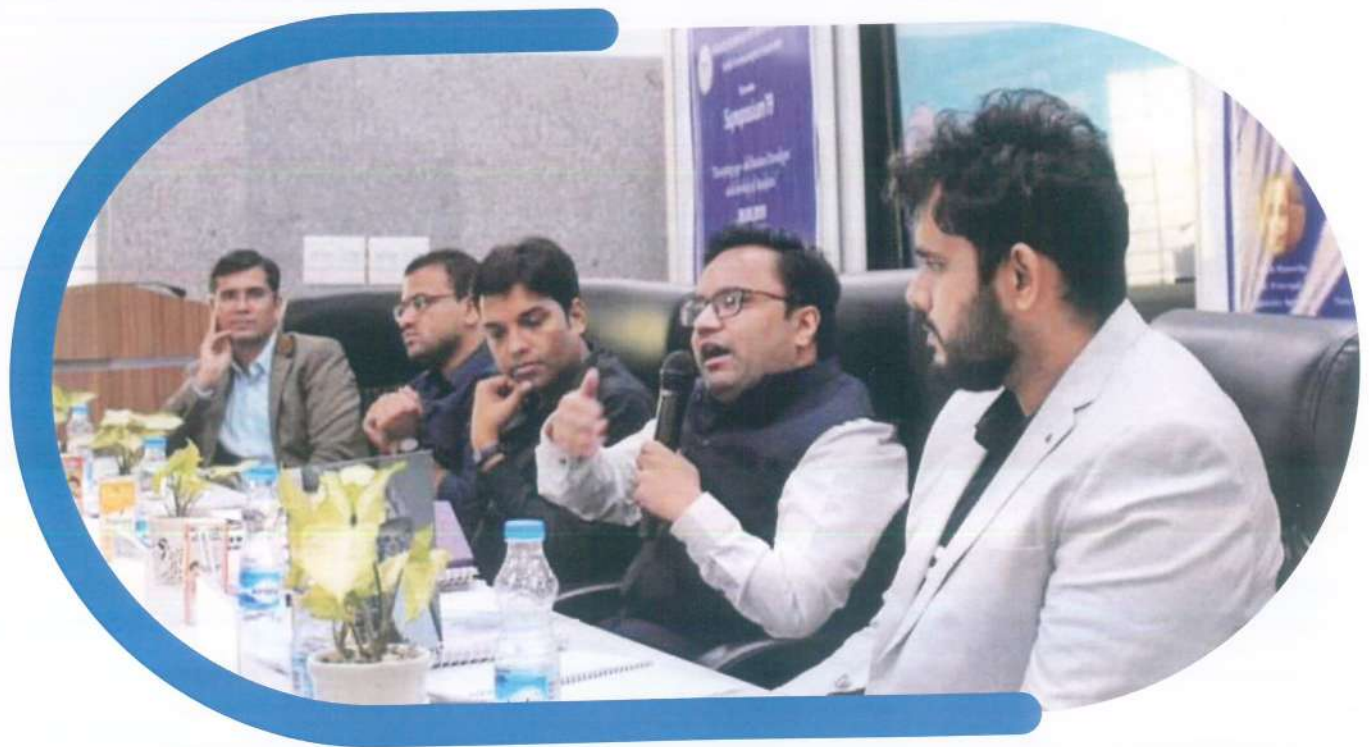
Symposium, Delhi School of Management